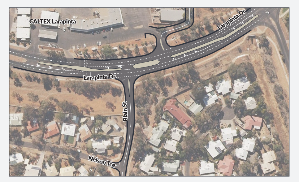
Figure 1: Current intersection alignment

There are significant traffic hazards and delays at these intersections from vehicle and pedestrian traffic around the Araluen Christian College and the Diarama Village Shops.